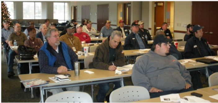
A Safety Restraint Training Class was held on November 27, 2012 in Rock Hill, SC. Approximately 30 SGFMA members attended the training session.

Debbie Henson @ dhenson@cityofrockhill.com