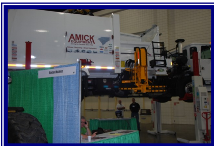
2012 Annual Meetings Pictures