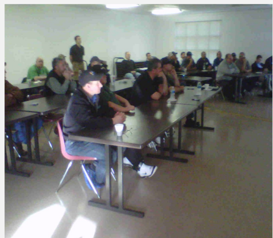
On January 10, 2013 a training class on "Understanding Fuel Management, Emissions and Oil Analysis" was held in Hickory, NC.