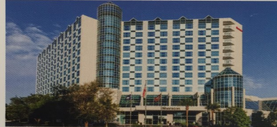
Myrtle Beach Sheraton & Convention Center Myrtle Beach, SC

SGFMA Annual Meeting & Equipment Show Oct. 11 - 14, 2015