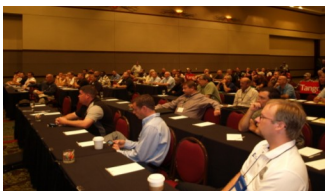
Attendees at a 2010 Annual Meeting Training Session

Although this year's annual meeting classes are set, we continue to encourage our members to contact us and let us know their needs and ideas for the 20th Annual Meeting next year.