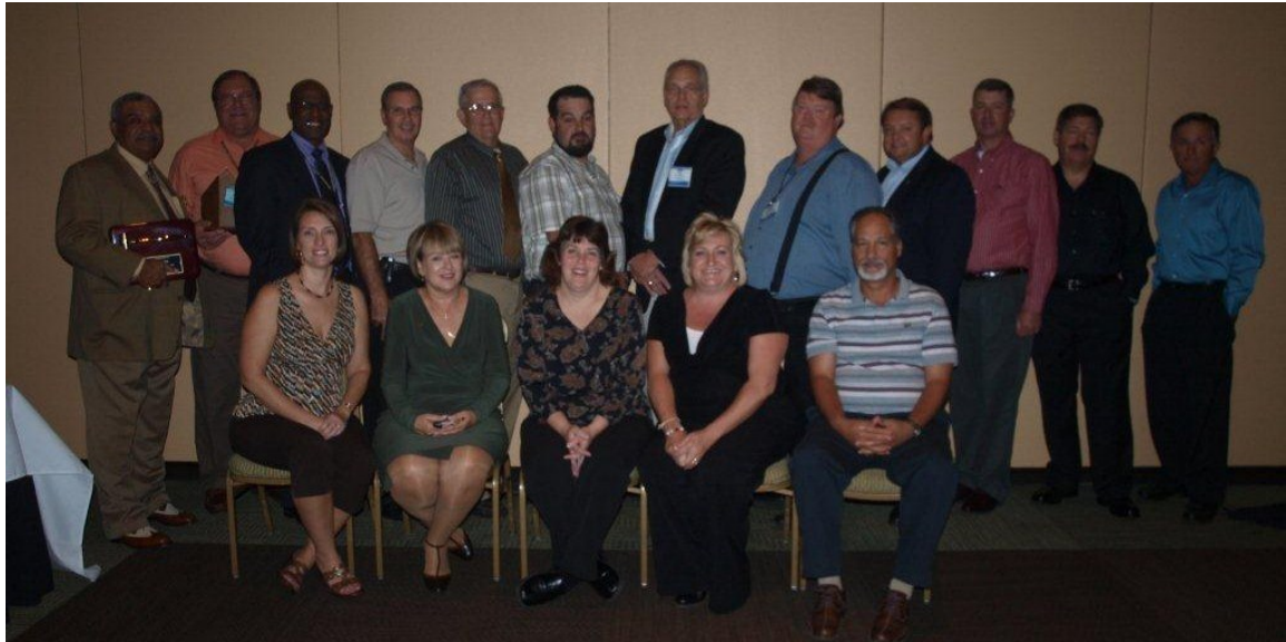
SGFMA 2012 Officers