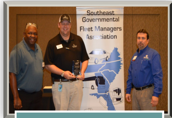
Columbia County, GA receives the 2018 SGFMA Award for Quality Fleet Management (County Agency).