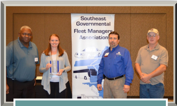
City of Rock Hill, SC receives the 2018 SGFMA Award for Quality Fleet Management (City Agency).