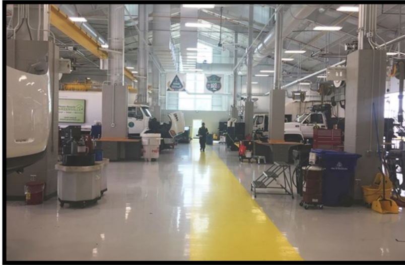
City of Greenville's New Fleet Facility

The City of Greenville, S.C., moved into a new fleet maintenance facility in October 2017, moving all fleet shop equipment with no interruption in service. The new facility replaces a 60-year-old building. The upgraded site is part of a 22-acre Public Works campus, which cost $20 million. Of that, the fleet maintenance facility cost about $8 million.