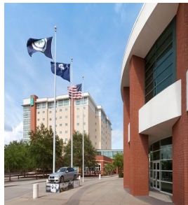
Embassy Suites & North Charleston Convention Center

the answer; they usually have a suggestion on someone that will be able to help you.