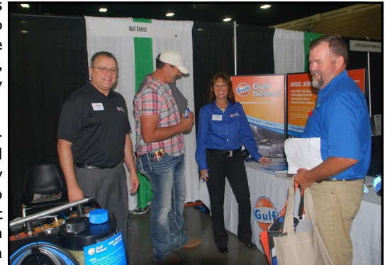
2016 Conference Attendees visiting the Gulf Select booth.

are more than willing to share the knowledge that they have gained through the years. I have personally contacted other members that I have met through SGFMA with questions and have never been disappoint-