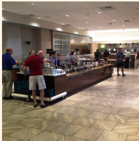
Breakfast was a good start to everyday!