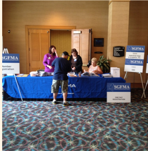
At The Registration Desk