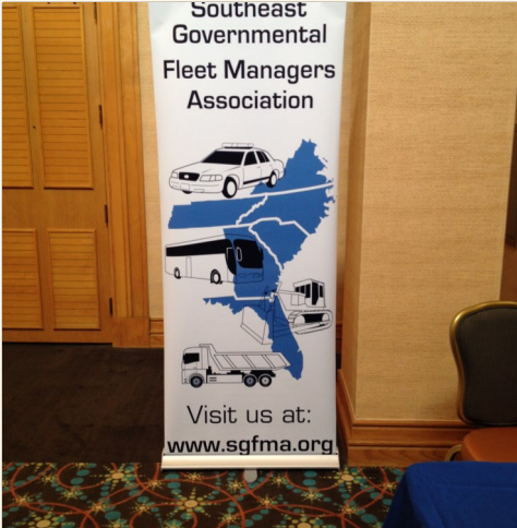
SGFMA Welcomes You