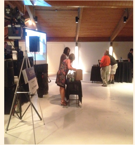
Golf Tournament Awards