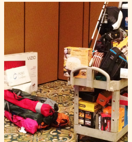
Lots of prize give-a-ways!

"I also think this show surpassed all our expectations. I have had several comments about how much the training sessions were "spot on" and very well presented. Even the equipment/vendor show was very well received with the slight rain issues. And the lunch provided by Lighten Up was the talk of the event."