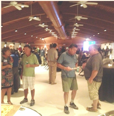
Meet & Greet - Light Hors d'oeuvres & Sprints