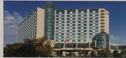
Myrtle Beach Sheraton & Convention Center Myrtle Beach, SC

SGFMA Annual Meeting & Equipment Show Oct. 11 - 14, 2015